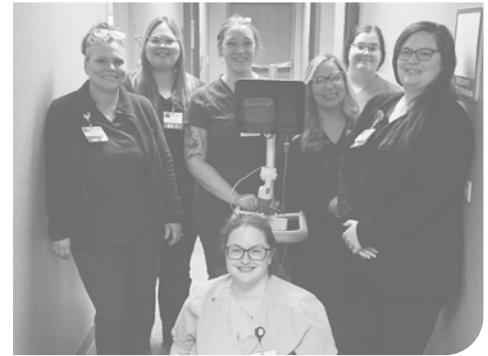
Aspirus Medford Clinic staff, pictured with a new state-of-the-art bladder scanner.

For more information about this project or to learn how you can support future initiatives, please contact the Aspirus Health Foundation.